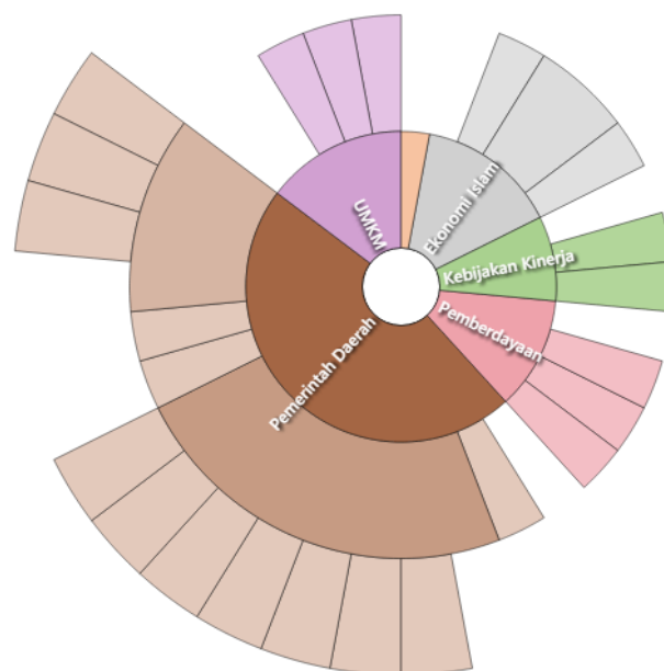
Figure 3 Hierarchy Diagram of Bukittinggi City Government Performance Policies Towards MSMEs and Street Vendor Empowerment in Review of Islamic Economic Perspectives