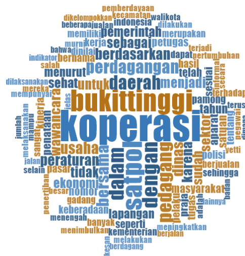
Figure 1 Most Frequent Words from the Data