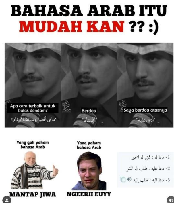
Figure 1. Lughoty's Instagram Content

The content that is used as an object in this research is as follows: