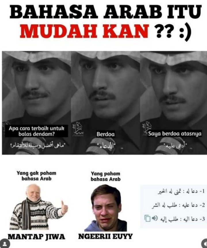
Figure 1. Lughoty's Instagram Content

The content that is used as an object in this research is as follows: