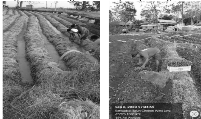
Figure 4. The direct application of growing media into agricultural fields