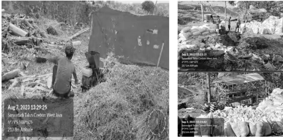
Figure 2. Making planting media in sacks