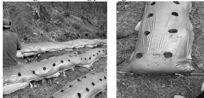
Figure 3. Planting non-rice crops in planting sacks