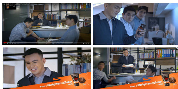
Figure 2.4 Visual Sign Signification of PM Energy Charge

Figure 2.4 shows the men look exhausted after doing their job. Through Figure 2.4 the portrayal of masculinity in this advertisement reflects through the setting and the properties. As explained the setting signifies ambitiousness and the properties signify strong, responsible, disciplined, and success oriented ambition. This is in line with Chafetz (cited in Merdeka & Kumoro, 2018), that success-oriented ambitious, strong, and disciplined are the characteristics of masculinity.