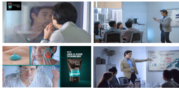
Figure 2.3 Visual Sign Signification of PM Acne Solution

As can be seen in Figure 2.3, the data is talked about an employee who will make a presentation of his work. The man looked in the mirror and realized that there was an acne on his face after that, his confidence to make a presentation suddenly dropped drastically and he started to lose his focus. However, when that happened, he kept trying to look calm, until he finally found a solution to get rid of the acne, the man used the product. So, in the end, the man can focus and be confident again and continue his presentation satisfactorily.