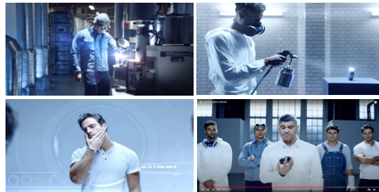
Figure 2. 2 Visual Sign Signification on NM Crème

In Figure 2.2 it can be seen a process of making the product offer. The first scene shows a man making a cane for the product package with welding. After the package is welded, the next scenes show a man making side grips as detailed, to make the product more detailed, in another room there is a man in charge of coloring the package of the product. In the end, all the workers and the scientists gathered to test the product on a man. Finally, the product functions according to its purpose.