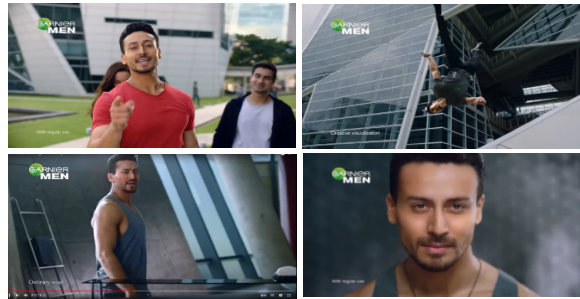
Figure 2.5 Visual Sign of GM AcnoFight Anti-Pimple Face Wash

In Figure 2.5, it can be seen that a man is generally associated with various outside activities. He runs from pimples caused by germs and oil attacks. Exercising is quite hard as seen in the picture, besides that men are also synonymous with social butterflies where they can easily socialize.