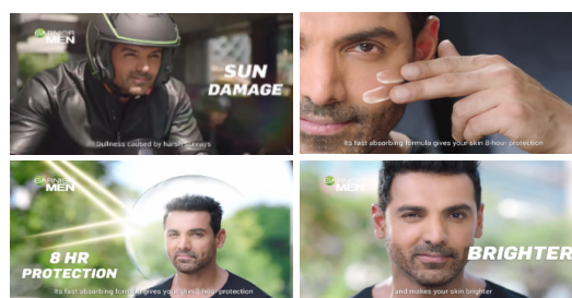
Figure 2.6 Visual Sign Signification of GM Power White Moisturizer

Figure 2.6 shows the actor riding a sports motorbike where in the middle of his journey he encounters various things including pollution from other vehicles, the scorching heat of the sun, and road dust. This made the actor's face dirty and dull.