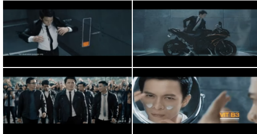
Figure 2.7 Visual Sign Signification of VM 2 Steps to Brighter Skin

As can be seen in Figure 2.7, a man who rides a motorsport and carries out his busy activities as an artist, especially a musician.