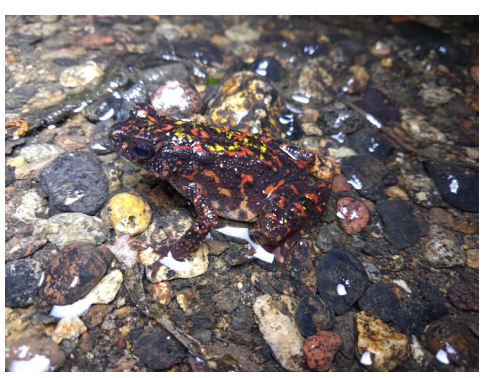
Figure 2. Bufonidae family (Leptophryne cruentata)

has a small to medium size. This species was only found at site 3 because this location is the natural habitat of the red toad. Red toads are found under the bridge of Curug Cibeureum and on the rocky cliffs near the waterfall flow of Curug Cikundul. Red toads love the rushing and cold flow of water, the location where at night the temperature reaches 18°C. Red toads are not found at site 1 and site 2 because this location has no heavy water flow and rocky walls covered with moss. Many red toads are found hiding in rocky walls that are difficult to distinguish by the color of their skin at night.