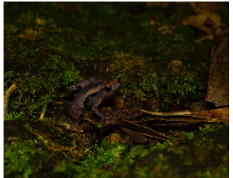
Figure 6. Microhylidae family ( Microhy-la palmipes )

istic thick litter cover according to its habitat. At site 1 M. palmipes were found on rocky roads covered with litter of dry leaves close to streams of water. At the 2nd site M. palmipes was not found because this location is a tourist location that is often visited by tourists so the habitat of M. palmipes is slightly disturbed by human activities. At the site 3 M. palmipes was not found because at this location has the characteristic of thin litter cover.