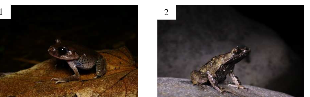
Figure 5. Megophrydae family (1) Leptobrachium hasseltii, (2) Megophrys montana

found at site 1 and site 2 because this location has the characteristic of a denser litter cover compared to site 3. Dense litter cover is the habitat of L. hasseltii . M. montana has a special feature of eyelids resembling horns. M. montana is generally brown in color resembling the color of dry leaves making it difficult to find.