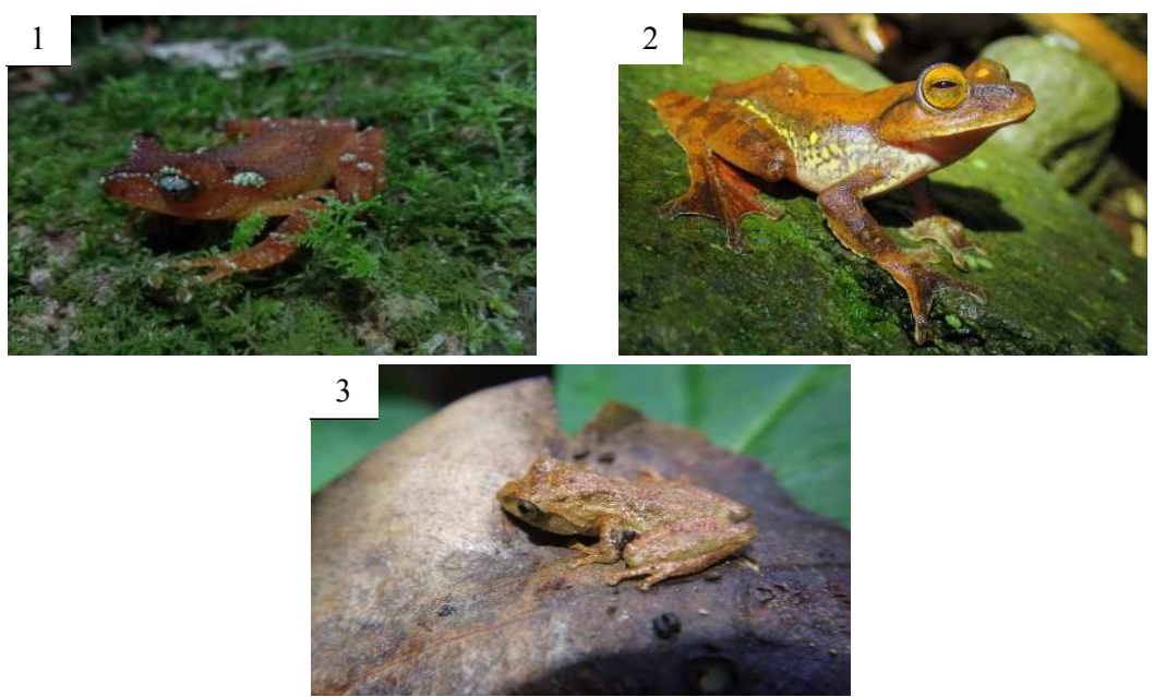
Figure 4. Rhacophoridae family (1) Nyctixalus margaritifer, (2) Rhacophorus margaritifer, (3) Philautus aurifasciatus

The Megophrydae family is often known as litter frogs because they are often found under litter or dry leaves. The species found from the Megophrydae family were Leptobrachium hasseltii and Megophrys montana . L. hasseltii has a special feature of large and rounded head, larger than its body, and large bulging eyes. L. hasseltii was only