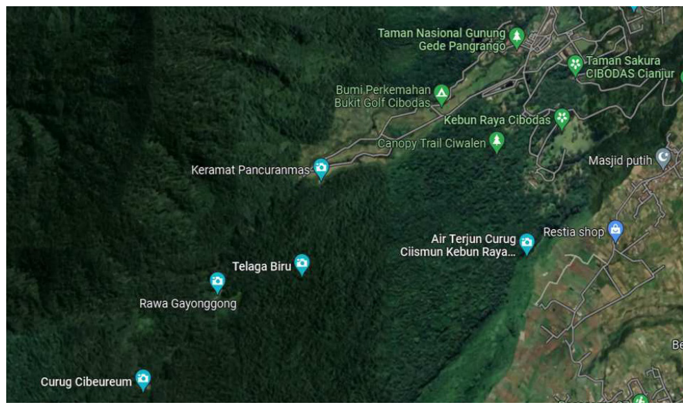
Figure 1. Research path map

al., 2015). Measurement of environmental data included temperature and humidity. Data analysis used was the Shannon-Wiener diversity index. The observation was conducted in 3 sites, site 1 and site 2 were located on the Ciwalen waterfall tourist route. Site 1 (HM 0 -3) has the characteristics of a rocky road with a thick litter cover, a fairly dense vegetation cover with small river flow that is favored by amphibians, site 2 (HM 4 - Curug Ciwalen) has the characteristics of a denser vegetation cover compared to site 1 which is dominated by taro trees with a fairly fast waterfall flow and station 3 located on the Curug Cibeureum tourist line (HM 25 – Curug Cikundul). The path created is 350 meters long with a left right width of 6 meters. The path was made 350 meters long with a width of 6 meters to right and left. (Figure 1).