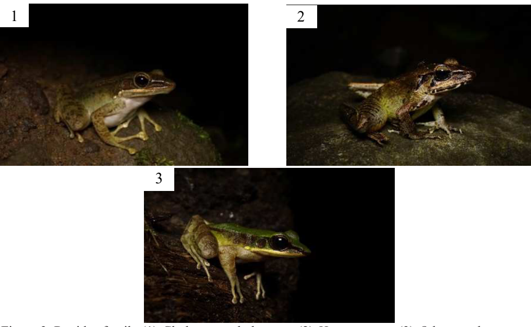
Figure 3. Ranidae family (1) Chalcorana chalconota, (2) Huia masonii, (3) Odorrana hosii

there are no taro trees. In addition, site 3 has an altitude of 1600 – 1750 meters above sea level. This location is too high to be occupied by amphibian species. H. masonii and O. hosii were found on rocky walls near the flow of waterfalls and on the banks of streams. At all three observation sites there are streams that are the habitat of H. masonii and O. hosii . H. masonii is found in aquatic habitats while O. hosii is found in semi-aquatic habitats (Septiadi et al., 2018).