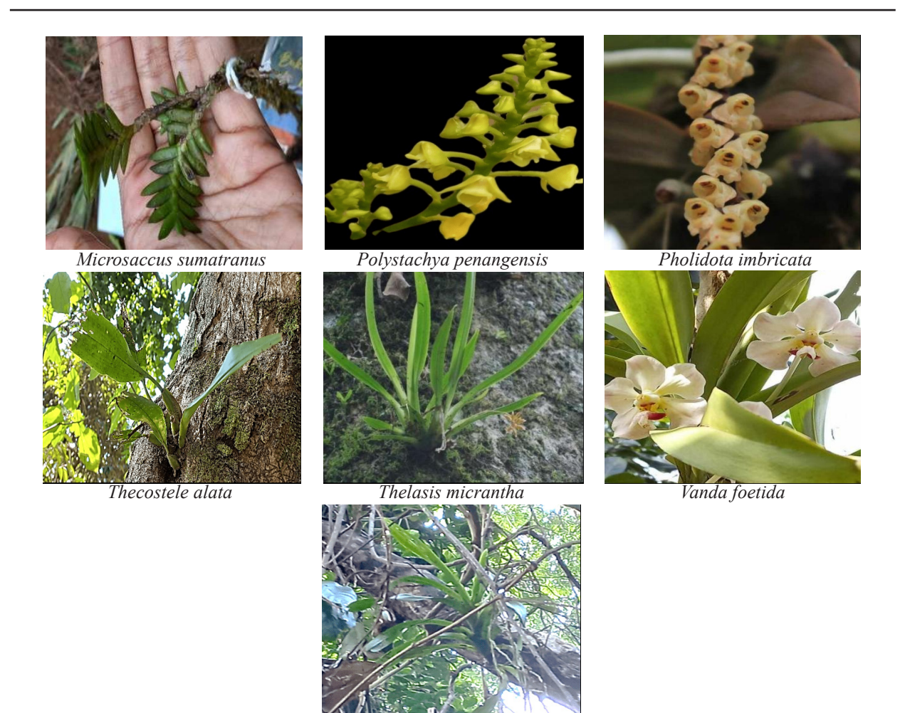
Figure 1. The results of the orchid exploration research

http://journal.uinsgd.ac.id/index.php/biodjati