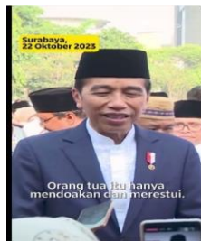
Figure 1. The President's Initial Attitude Before Gibran Rakabuming Raka Was Nominated as Vice Presidential Candidate