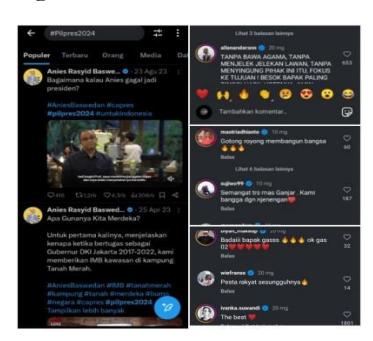
Figure 2. Gen Z interactions on Instagram and X platforms Gen Z interactions on Instagram and X platforms

Social media is a source of information for Generation Z, including political information. Platforms such as Instagram, TikTok, Twitter (X), and YouTube are the primary sources of information and play an important role in shaping political opinions and encouraging participation in the 2024 presidential election. This study's results indicate a significant relationship between social media use and Generation Z voting behaviour in the context studied. In this case, social media use influences how Gen Z engages in the political process, forms political attitudes, and makes voting decisions.