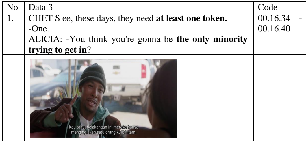
Table 3. Data 3 of Institutional Racism

Table 3 above is an example of institutional racism in the film Where's the Money (2017) which is depicted and still happens a lot in the real world. When Chet wants to disguise himself as a student who enrolls in the fraternal community, he aims to be able to enter and simultaneously take the money from the robbery in the basement by Chet's father. Chet said with great confidence that he would disguise himself as a student. That's when Alicia doubts Chet's plan, knowing that there might be a lot of applicants who come from minorities like Chet.