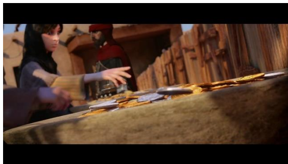
Figure 3. Screenshot of the scene in 00:09:13

Besides, Umayya and friends also asked several men to influence people to worship idols. These men promised prosperity and happiness to anyone who pray to idols and vice versa, these men frighten those who do not worship idols into living in sadness and misery. Then, people got influenced and ended up throwing their money at the idols.