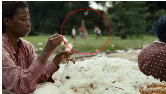
Figure 7. Screenshot of the scene in 00:58:13

plays a prominent role because it builds another level of emotional stimulation to the viewers (Boggs & Petrie, 2008, p. 257). So, with this sound, the researcher believes this scene is showing that Northrup is being punished, even though the image was blurred by the filmmaker. The scene when Northrup and his two friends were being whipped are as in the screenshot below