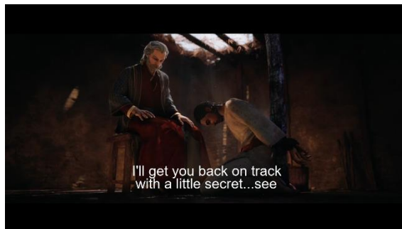
Figure 5. Screenshot of the scene in 00:59:20

However, after Umayya heard the news that Islam was developing, Umayya knew that Bilal, one of his slaves, had practiced Islam. Bilal also acknowledged this and he loudly stated that now he was a free man, just like Umayya. This made Umayya angry. He immediately tortured Bilal to make Bilal afraid and returned to being his slave and left Islam. This was done to prevent Islam spreads to other slave. This can be seen from the following scene: