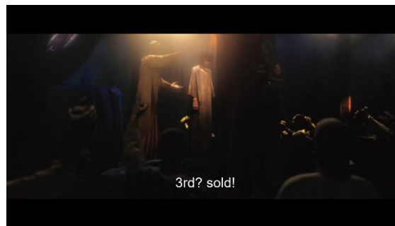
Figure 1. Screenshot of the scene in 00:14:47

Sometimes Okba also auctioned off slaves and the slaves would be handed over to the person making the highest bid. This is represented by this scene: