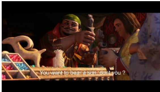
Figure 2. Screenshot of the scene in 00:07:34

Okba : Idols for sell! They come in all colors and shapes. They make your wishes come true! Idols for fame .... Idols for strength.... Idols for fertility.... Idols for beauty!