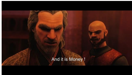
Figure 4. Screenshot of the scene in 00:50:53

One day, the news that Islam, the religion that was spread by the Prophet appeared. Islam recommends to believe in Alloh and the elimination of the slavery system. Therefore, Umayya and his friends refused it firmly because it would harm those who were accustomed to enjoying the benefits of slavery system. It will also cause them loosing money from those who used to worshipping idols. Even Al Hakam said that the only God to him was money. This is really shows how greedy Umayya and friends were. The rejection of Umayya and his friends towards Islam is depicted in the following picture