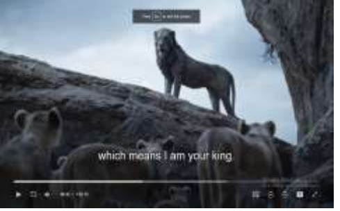
Figure 2 [DATA 2] how to announce mufasa's death. (The Lion

[Scar announced Mufassa's death to all the inhabitants of the Pride Lands, as well as showing false compassion and at the same time leading the residents of the Pride Lands by saying that the Pride Lands must have a wise king successor.]