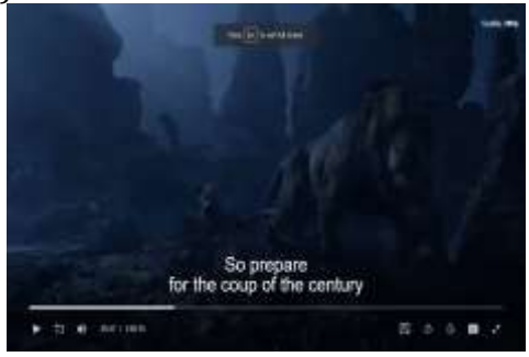
Figure 1 [ DATA 1] Scar leads the Hyenas to stage a coup ('The Lion King, 2019)

At night, Scar came to the Hyena's Territory with a specific purpose. Shown in minute 34:23 when Scar came over to the Hyenas and said that he made Simba come to their Territory. "and yet i send two little cubs your way...And they comeback alive, ...Why eat one meal, When you can be feasting the rest of your life?" (Scar, 34:33, The Lion King). By influencing the Hyenas, Scar has a stronghold and comrades to fight Mufassa. Hegemony is essentially a way or process of leading (influencing) others to believe in the dominant discourse within the framework determined by those in power (Sary, 2013:5). The statement means that Scar offers interesting things for the Hyenas to get food, but Hyena insists that Pride Lands is above Mufassa's power, Then Scar