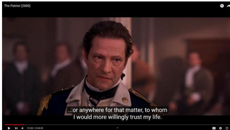
Figure 1. Conversation which Contained Moral Value

believe that showing respect for others equates to having lower self-esteem. That impression is incorrect.