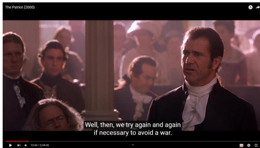
Figure 3. Conversation which Contained Moral Value

Everyone values the truth, and this is what honesty is all about. In addition to enabling people to feel secure and at peace inside and, of course, comfort in having someone they can trust, telling the truth enables everyone to know what happened. We must also understand that because humans are social organisms, we cannot stand on our own but rather require assistance from others. Therefore, in order to function as social creatures, we must be able to respect one another and recognize the importance of those who support us in life. We risk losing people who support us and losing momentum at a time when we most need it if we can't respect one another and thank those who do. People who support us, our families, and our friends are the ones who make us social beings.