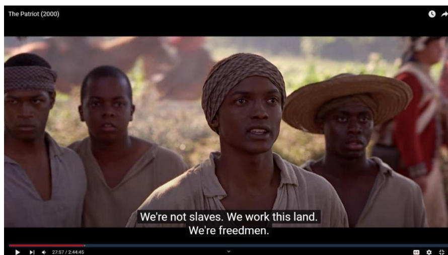
Figure 4. Conversation which Contained Moral Value