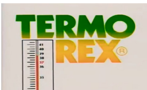
Figure 9. The Child's Lowered Temperature with a Combination of Green and Yellow Colors in Thermometer after Termorex Administration