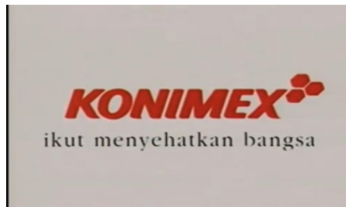
Figure 12. Manufacturer of Termorex

Next, the sign in the picture shows how to take the drug Termorex, the drug is taken once a spoonful (Figure 7). Then the picture next to it shows a red color on the word Termorex. Another sign shows a body temperature that reaches 40 degrees Celsius. It shows an effect of the termorex to the body healing. This is in line with the statement provided by Bendixen (1993) that a sign can be significance in affecting the object. The object of the first image shows a child drinking a thermometer medicine that his mother drank. The second picture shows a red object in the word Thermax and the number 40 degrees Celsius. The interpretation shows how to take the medicine Termorex, then the red color on the writing indicates that the heat experienced by the child is a dangerous condition because the fever is high and the temperature reaches 40 degrees Celsius (Table7).