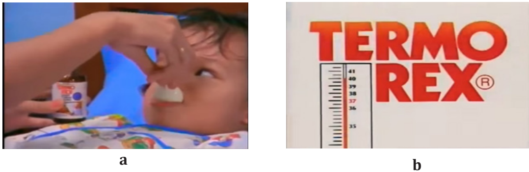
Figure 7. The Child was given Termorex (a). The Child's High Temperature with Red Color in Thermorex Thermometer