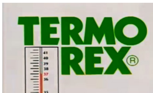
Figure 10. The Child's Normal Temperature with a Green Color in Thermometer after Termorex Administration

After taking a sample of data based on Berger's advertising criteria, the writer then found 13 samples of advertising images which were then re-selected using the opinion of Arikunto (2013) who gave the opinion that for descriptive research, the minimum sample is 10% of the population. So the author takes 70% of the 30-second video that can be screen captured by the device. And then the twelve advertising images that have been selected, identified and classified by the author one by one into the sign type of theory Charles Sander Pierce based on the object that is sign, object and interpretant.