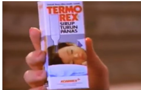
Picture 6. Termorex Package