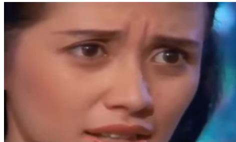
Figure 5. A Mother Heard a New Word and Misspelled It

said and what is written or read. Setting the meaning of a sign requires social convention among the language community where the meaning of a word arises due to an agreement between the language user community. The sign is a mental picture, thought, or concept (material aspect of language). Language as a sign system is indicated by a close relationship between significant, signify, form, and substance: (a) Significant is a description of the order of sound in an abstract way in the inner consciousness of the wearer; (b) Signify is a description of meaning in an abstract way related to the possibility of a relationship between the abstraction of sound and the outside world; (c) Form is an abstract rule that regulates the relationship between sound abstraction items so that they can be used for expression; and (d) Substance, namely the embodiment of the typical human speech sound.