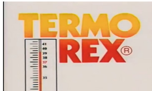
Figure 8. The Child's Lowered Temperature with a Combination of Yellow and Red Colors in Thermometer after Termorex Administration