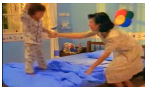
Figure 11. The Child is Getting Well after Termorex Administration

the scene is a knock on the door. Where to knock on the door, you will enter or visit if you go to someone's house (Table 2).