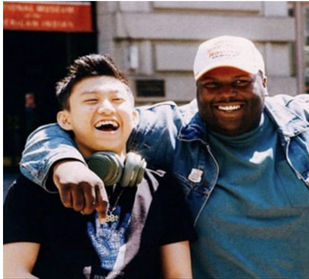
Figure 4. Rich Brian's Instagram Post on August 30, 2023

The photo with a hugging pose uploaded on August 30, 2023 shows Brian's closeness with August 08 as a fellow rapper and also part of an ethnic minority group in the US.