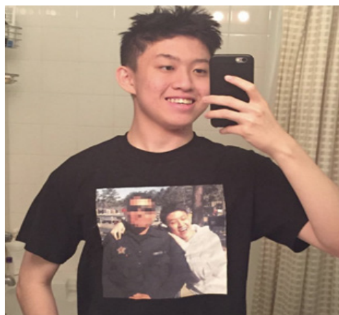
Figure 1. Rich Brian's Instagram Post on August 10, 2017

This post was uploaded on August 10 2017, long before the Covid-19 pandemic spread throughout the world (Figure 1). In this post, Brian printed a photo of himself with an American police officer whose face blurred on the t-shirt he is wearing. Selfies