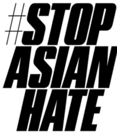
Figure 3. Rich Brian's Instagram Post on March 18, 2021