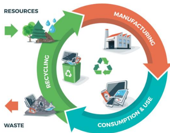
Figure 3. Environmental Dynamic of Recycling