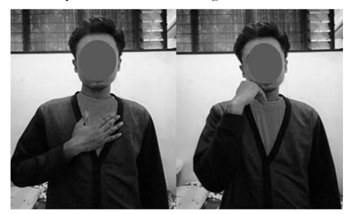
Figure 3. BISINDO Model used to Express "I am unemployed"

The method of spelling with the hijaiyah sign language guidelines above is very suitable for deaf children in Bengkulu city because it is in accordance with the way they communicate using the BISINDO method. In BISINDO, the sentence "I am unemployed" is enough with two signs, namely a sign like someone who is lazy or doing nothing. Gestures communicated in BISINDO are always accompanied by natural expressions and circumstances. No wonder if its use is felt easier and more practical as shown in Figure 3.