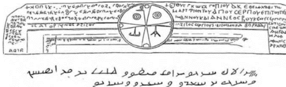
Figure 2 The Inscription Zabad (In the name of Allah: Sergius son of Ahmad, Manaf and Hani, son of Mar al-Qais, Sergius son of Sa'ad, and Sitr and Shauraih).

Due to the point of development of Arabic scripts, inscriptions found in Zabad, west of the city of Halab (Aleppo) Syria, can be considered the oldest Arabic literary inscriptions. Interestingly, this inscription begins with the reading Bism al-Allah (short form of ' Bismillah , in the name of Allah') (Shihab, 1997; Trimmingham, 1979, p. 126). Then, it contains the names of the self that can no doubt be Christian Syria.