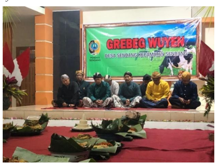
Figure 5 Grebeg wuyen Ritual

The Grebeg wuyen tradition in Sendang Village is a ritual ceremony that is carried out every seven months and is carried out every Friday Wage night (see Figure 5). The grebeg wuyen tradition is a hereditary tradition from the ancestors of the Sendang village community to commemorate the birthday of the dairy cows they raised. In addition, grebeg wuyen is also gratitude from the people of Sendang village to the Almighty God because since the people of Sendang Village have become accustomed to raising dairy cows, their income and economy are getting better. Therefore, gratitude for the sustenance they have gained is implemented in the ritual of the Grebeg wuyen tradition.