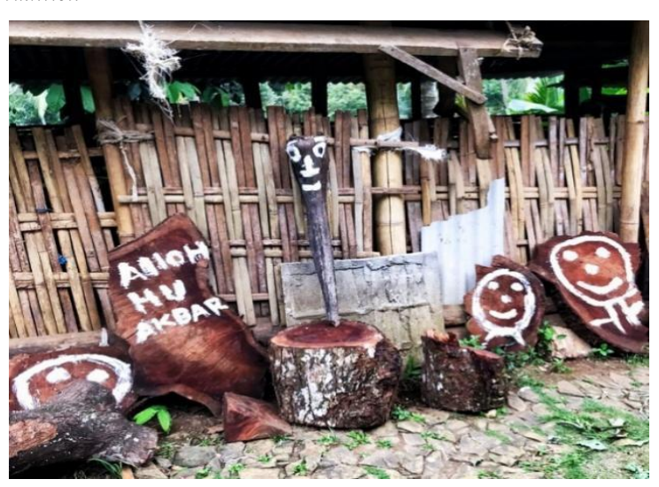
Figure 6 Tetek Tetek tradition

Tetek Melek is an art of painting with the medium of hunchback or fronds of dried coconut leaves that are taken at the stem (see Figure 6). These fronds are then painted with a variety of "scary" characters. Tetek Melek are usually placed in front of the house or terrace, precisely on the poles of the house near the door. In southern Tulungagung, every house put a Tetek Melek when pageblug (pandemic/catastrophe). We observed during student ventures program (KKN 150) of UIN Surabaya which located in Sendang Village accompanied by Mr. Wiyanto as the head of Sendang Hamlet, in a house that is prone to landslides.