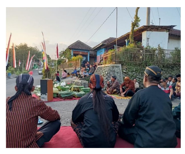
Figure 7 Suroan Festival