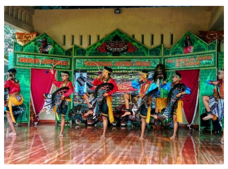
Figure 3 This is an example of an image of the Jaranan tradition found in Sendang Village

Jaranan dance is a legacy of Sunan Kalijaga and Sunan Bonang. Jaranan in Sendang Village has various movements and types (see Figure 3). In the jaranan dance, there are several groups, and each group has distinctive characteristics that are different from other groups (Safira & Mariasa, 2021, p. 210). This characteristic is not only found in the jaranan dance but also other dances. Jaranan dance in Sendang Village has three types, namely Javanese Jaranan, Sentherewe Jaranan, and Reog Kendang Jaranan. The explanation is as follows: