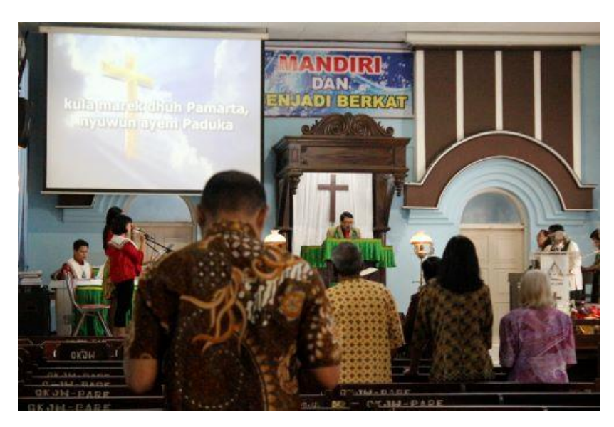
Figure 1. Javanese Sunday Worship

The Undhuh-Undhuh rite and the weekly Sunday morning worship session contribute to the acculturation of the culture. Typically, Christianity observes Sunday worship in the official language of a nation. However, the Gereja Kristen Jawi Wetan conducts three worship sessions every Sunday. Figure 1 shows Sunday morning worship that features lyrics in Javanese. The initial session takes place at 06.00 WIB in the Indonesian language, followed by the second session at 09.00 WIB in Javanese. The cultural patterns in worship are evident, as the songs sung are translated into Javanese, as shown in Figure 2. The final session resumes at 5.00 pm in Indonesian (Mizro'atul, 2021).