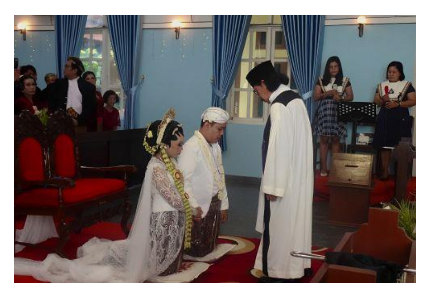
Figure 3. Holy Sacrament of Marriage

GKJW has assimilated the Sacrament of Marriage into Javanese culture. It is evident in the attire of the bride and groom, as well as several members of the congregation who observed the ceremony, donning kebaya and Javanese traditional garments emblematic of Javanese culture (Anam, 2021). The declaration above proves that the assembly of the Gereja Kristen Jawi Wetan Pare congregation does not eradicate their Javanese identity. Typically, Christian grooms wear a suit for the rite of marriage, while brides wear a wedding dress, as shown in Figure 3.