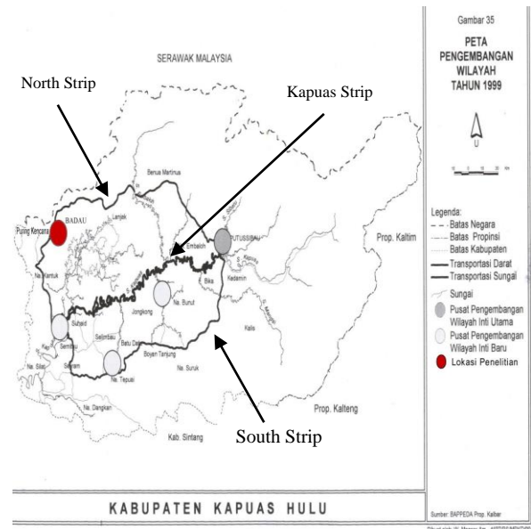
Figure 2: Map of Kapuas Hulu

Figure 2 is the map of Kapuas Hulu Districts that contains three areas: