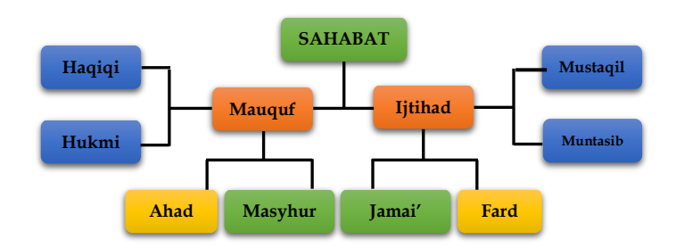
Figure 2. The ratio of Mauguf Hadith and Companion Ijtihad

The results of the study found that the ratio between mauquf hadith and companion ijtihad is shown in Figure 2.