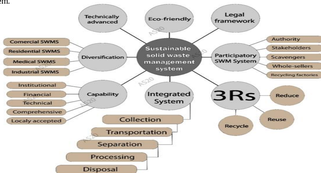
Figure 3. Desired Waste Management System for the Municipalities

In this sense, the circumstance looks more threatening. The discussion of the previous section and table 7 completely sums up the vulnerability and irregularity in the existing solid waste management system.