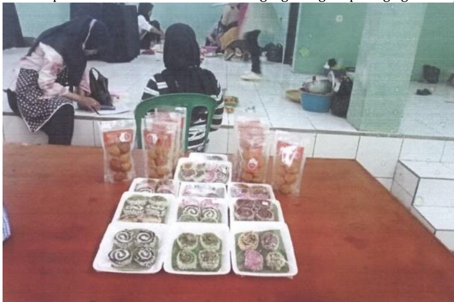
Figure 4. Food Product Packaging in Culinary Training

Figure 3 Show The culinary training initiated by the Ganjar Sabar Village Government for members of Kube Kembang Jayanti aims to develop the skills of this group of widows in processing various types of food. Through these skills, it is hoped that in the future the business will be able to develop and have sustainability because it has been equipped with an understanding regarding making various types of food in the Kube Kembang Jayanti Program by the Ganjar Sabar Village Government. After providing detailed knowledge and practices related to making various types of food. Kube Kembang Jayanti members were also given training regarding the food product packaging process. This is important to provide the best quality and also increase the price of a food product produced by Kube Kembang Jayanti members. Previously, Kube Kembang Jayanti members only packed minimal food products. This has implications for the quality and selling price of the food product. Through this culinary training program, Kube Kembang Jayanti members are provided with education and training regarding the packaging of food products.