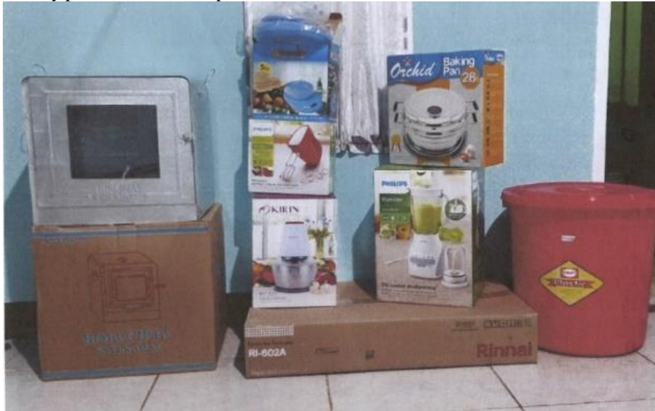
Figure 5. Cooking utensils for Kube Kembang Jayanti members

the culinary training program, Kube Kembang Jayanti members are serious about opening a micro business. By providing facilities in the form of cooking utensils, members of Kube Kembang Jayanti generally directly produce food and open micro businesses.