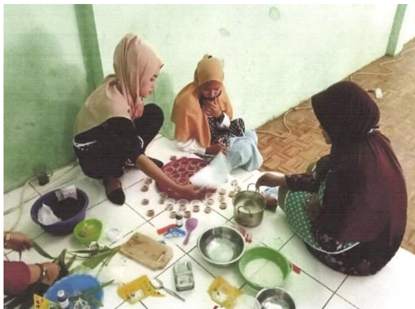
Figure 1. Kube Kembang Jayanti Culinary Training Program