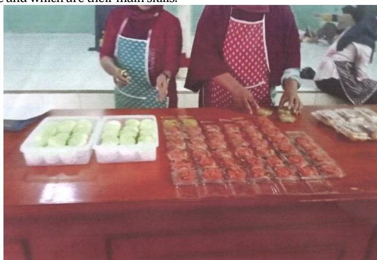
Figure 3. Examples of types of processed Kube Kembang Jayanti food

The culinary training program is carried out for all members of Kube Kembang Jayanti. The instructors for the culinary training came from representatives sent by the Bandung Regency Regional Government through an invitation from the Ganjar Sabar Village Government. Kube Kembang Jayanti members in the training activities held for 20 days were equipped with an understanding of making various types of processed food. The types of food preparations taught include making various types of pastries, meatballs, wet cakes and various other types of food preparations. Kube Kembang Jayanti members in this program are given the freedom to practice making various foods. Furthermore, members of Kube Kembang Jayanti are also given the freedom to produce and market the types of processed products they like and which are their main skills.