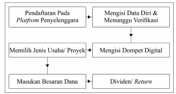
Figure 2 How to Invest in Shares in Securities Crowdfunding

Furthermore, how to invest in securities crowdfunding for financiers must do several ways including:<sup>9</sup>