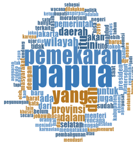
Figure 3. Word Frequency Query Papua New Guinea Plan

reaches 25% with the dominant presentation category after local elites. Local elite actors, in this case, are regents, governors, party members, and DPRD. In the central elite is the President, members of the DPRRI, MPR, and Ministries. Apart from the central and local elites, the new DOB plan also involves the National Police with a 20% dominant percentage compared to the TNI, which is 8%. The involvement of religious leaders is much smaller with a percentage of 4% compared to traditional shops, which have a percentage of 12%, while civil society is at 0.00% participation. More details can be seen in the analysis of Word Frequency Query in Figure 3: