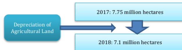
Figure 2. Depreciation of Agricultural Land

the Area Sample Framework (KSA) methodology using satellite imagery data from the National Institute of Aeronautics and Space (LAPAN) and the Geospatial Information Agency (BIG) see figure 2.