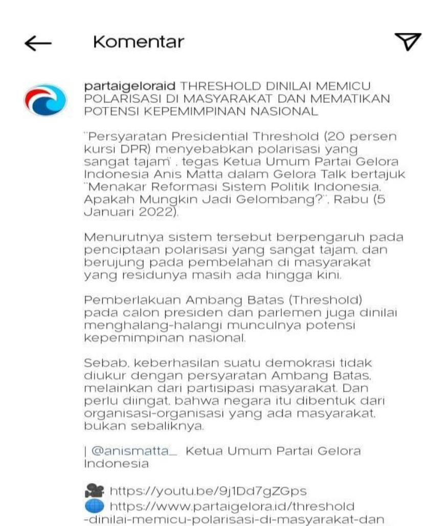
Figure 1 Presidential Threshold Policy Comments

-mematikan-potensi-kepemimpinan-nasional/