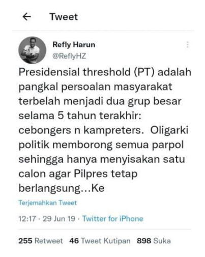
Figure 4. Collection of Citizen Comments on Social Media Regarding Presidential Threshold Year 2024

sahabat bangsa @Sahabat... · 14 Jur MENURUT ROCKY GERUNG, SIAPAPUN YANG AKAN MUNCUL DALAM PIMILU 2024 SEBAGAI CAPRES, KALAU MASIH ADA PRESIDENTIAL THRESHOLD 20 PERSEN, SULIT HINDARI KUASA OLIGARKI..