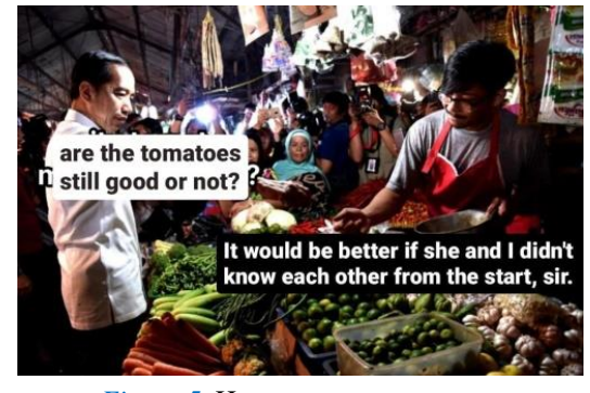
Figure 5. Humour memes sarcasm