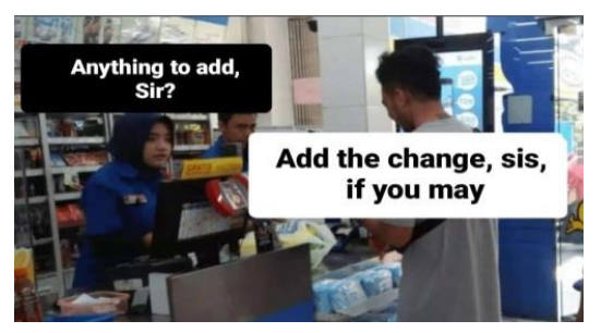
Figure 6. Humor memes entertainment

The study adopted statistical analysis, such as assumption tests (normality and homogeneity) and a hypothesis test using one-way ANOVA analysis. Furthermore, the significant differences in the effects of sarcastic text, entertainment text, sarcastic memes, and entertainment memes on positive emotions, were assessed using a one-way ANOVA test.