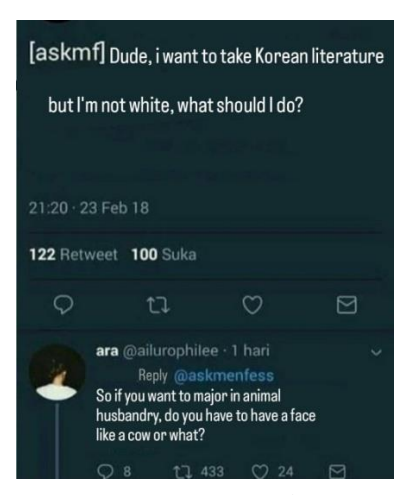
Figure 3. Sarcasm text humour

form of validated Twitter screenshots. After reviewing humour content, the third section, which included a posttest scale to measure differences in positive emotions based on humour types, was completed. A pretest was omitted to focus on the immediate effects of the treatment, as baseline measurements were unnecessary. Including a pretest could have disclosed the study objectives, potentially influencing post-test responses.