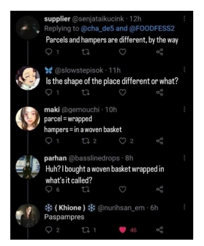
Figure 4. Entertainment text humour