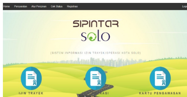
Figure 2 Si Pintar Solo website