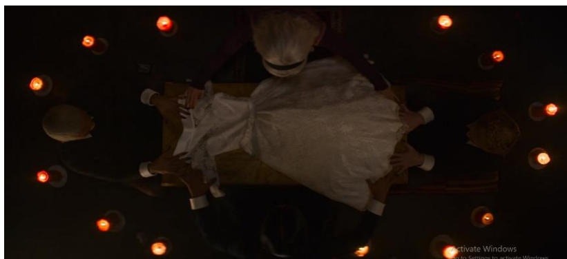
Figure 4 Sabrina and the Weird Sister are doing Séance (Chapter Eleven: A Midwinter's Tale, 00:17:07)

(Chapter Twenty-seven: The Judas Kiss, 2020, pp. 24-25)