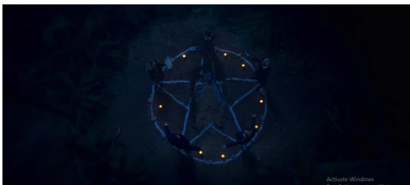
Figure 1 Sabrina, Nick, Prudence and Dorcas are doing the resurrection rite in the woods ( Chapter Eight: The Burial , 00:39:01)

Resurrection, also known as anastasis, is the notion of rebirth after death. A dying-and-rising god is a deity who dies and is resurrected in a variety of faiths. The witches also perform resurrection. By using their magical powers, they can resurrect that already death and become alive again, but there are several things that must be fulfilled. One of them is the sacrifice of life. Resurrection is a very dark, so that the witches seldom do the resurrection.