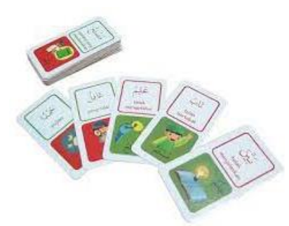
Figure 1: Example of a Domino Card in Arabic Learning