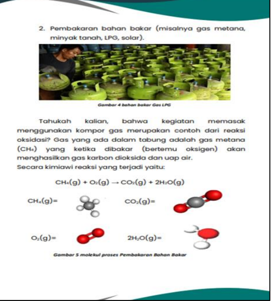
Figure 1. Display Module Content

The material in this product was developed according to core competence (KI) and basic competence (KD) in the 2013 curriculum. This module product contains oxidation-reduction reaction chemistry (Redox), which is presented with various representations: macroscopic, submicroscopic, and symbolic. The display of the contents of the module can be seen in Figure 1.