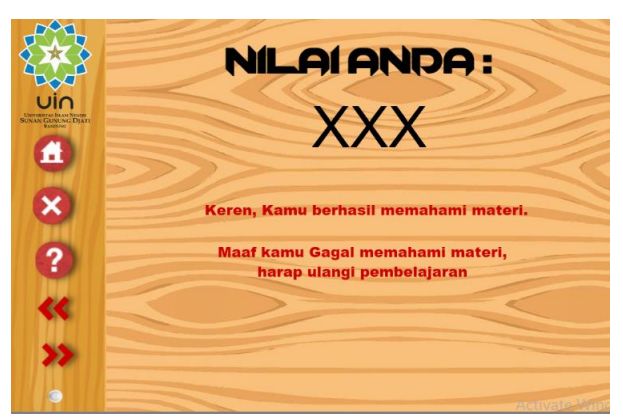
Figure 4. Learning Evaluation Questions Feedback

There are five knowledge questions to measure students' understanding of mastering learning material (Kurniawati, 2020). After students or readers have answered all the questions, they will be given feedback in the form of the scores obtained according to the answers that have been done and there will be corrections to the answers if there are wrong answers when working on the questions. The e-module feedback display can be seen in Figure 4.