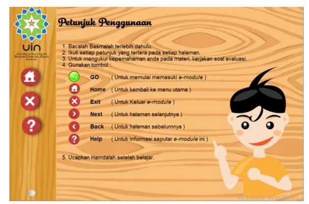
Figure 3. Instructions for Using the E-module

Instructions for use make it easier for readers to find it difficult or confused to run the emodule program (Wijaya et al., 2018). So that information is provided for the buttons used in the e-module. For example, the display of emodule usage can be seen in Figure 3.