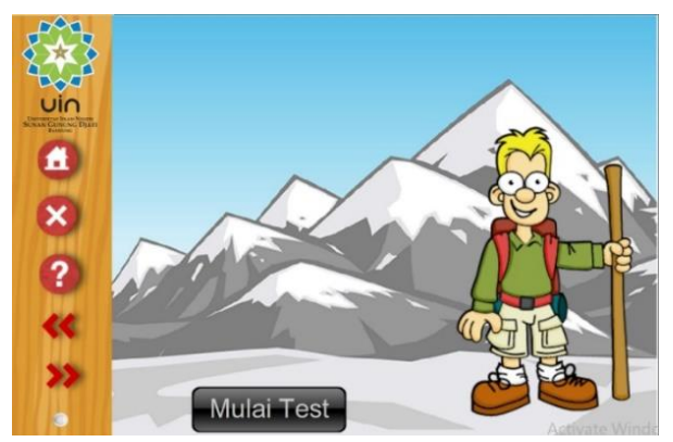
Figure 6. Cognitive Test

The display of the e-module material that has been corrected according to the validator's suggestions is as follows: