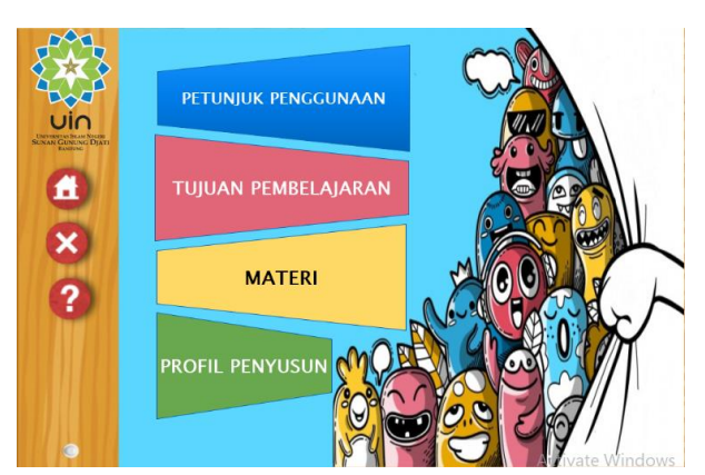
Figure 2. Table of Contents of the E-module