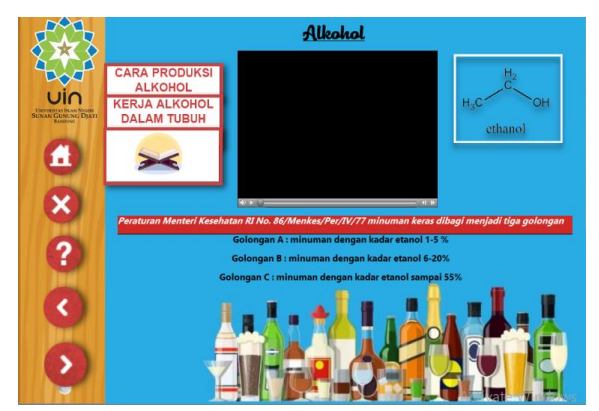
Figure 8. Display of E-module Content

Furthermore, alcohol is equipped with the ethanol structure, videos of the use of liquor in the community, and the classification of liquor based on its alcohol content. According to the minister of health regulation, the classification of liquor is divided into three groups, namely groups: A, B, and C. A display of e-module content is shown in Figure 8.