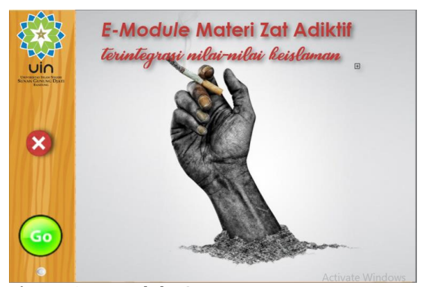
Figure 1. E-module Cover

On the cover, there is an identity that is contained in the e-module (Kurniawati, 2020). In addition, there is an e-module title for the topic of addictive substances integrated with Islamic values accompanied by a "Go" button that indicates to start learning on the next page. The cover display e-module can be seen in the Figure 1.