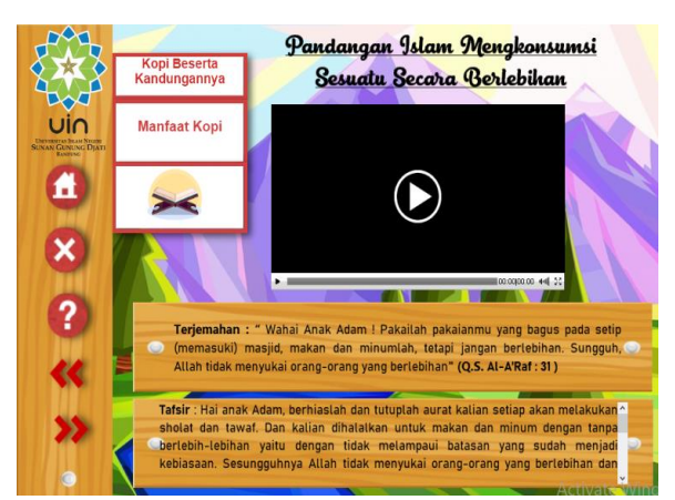
Figure 7. Display of E-module Content

Figure 7 shows a verse from the Al-Quran regarding the Islamic view of consuming something excessively contained in caffeine material. The Surah quoted is Al-A'raf verse 31, which is equipped with a translation and interpretation.